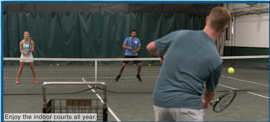
Enjoy the indoor courts all year.

Why should you become a member of the Bridges Resort community? Begin by counting the reasons. Consider our 12 indoor and outdoor tennis courts, three swimming pools, two saunas, hot tub, and our fitness room full of rowing machines, treadmills, stationary bikes, exercise balls, and free weights. Our resort also offers outdoor basketball and volleyball courts plus a playground for kids and families, as well as an indoor game room with ping pong, billiards and air hockey for everyone. Tennis, anyone? We offer tennis instruction throughout the year and professional tennis exhibitions all summer long on our outdoor courts with plenty of hillside