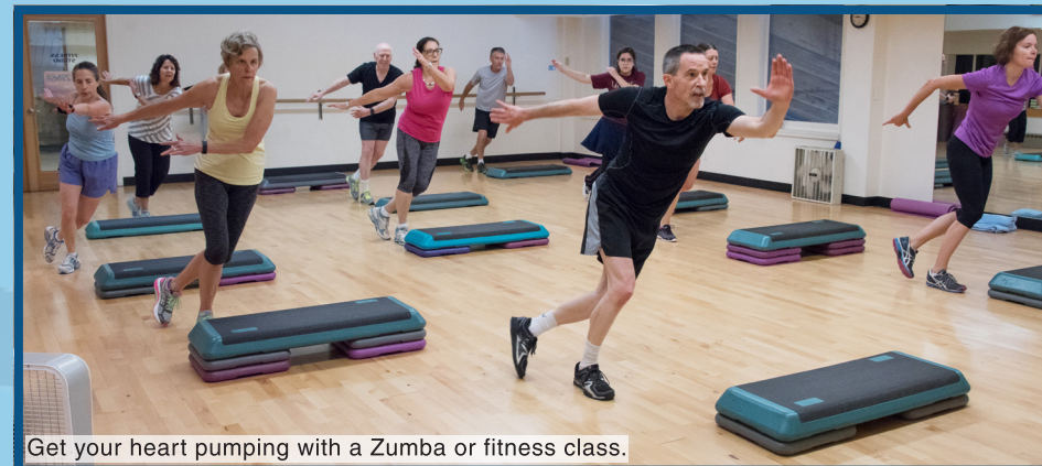
Get your heart pumping with a Zumba or fitness class.