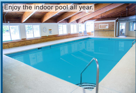
Enjoy the indoor pool all year.

802.583.2922 www.bridgesresort.com @bridgesresortvt @bridgesresort